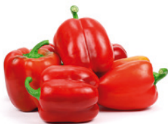
Paprika (red as purree)