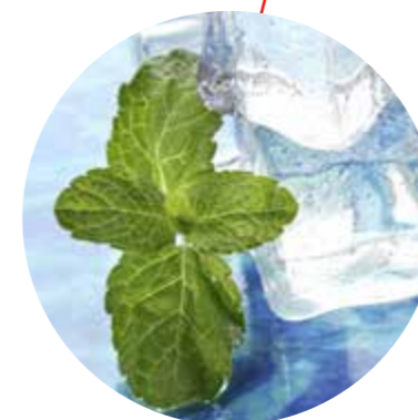
TOP NOTES Page 20