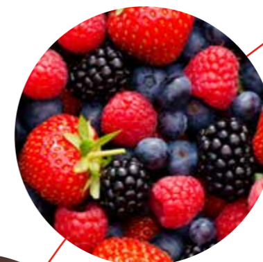
RED FRUITS Page 12