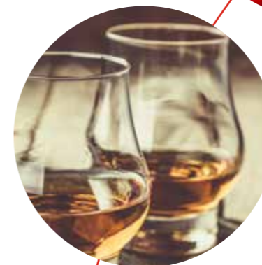
ALCOHOL NOTES Page 16