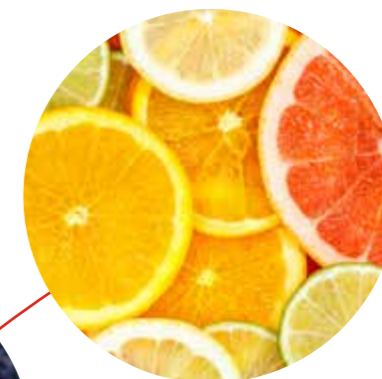
CITRUS Page 8